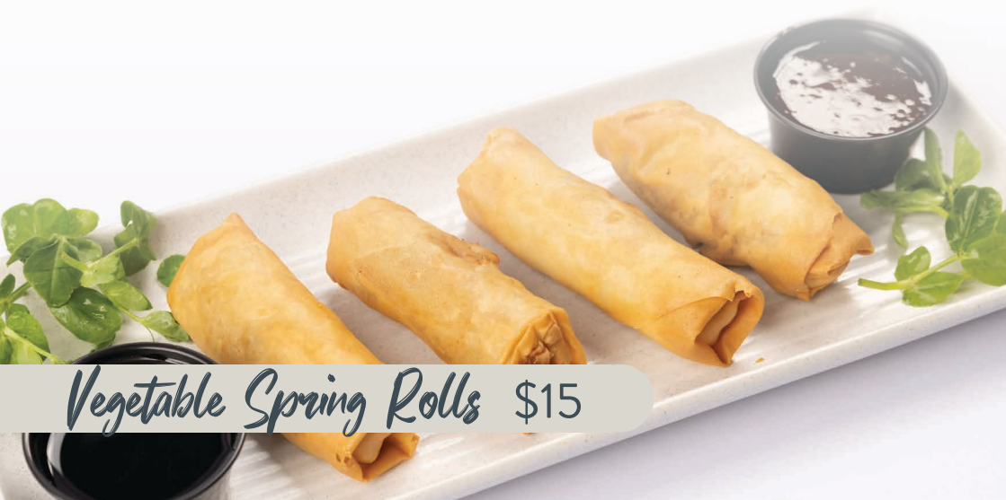
Vegetable Spring Rolls $15

15% Public Holiday surcharge applicable on all menu items